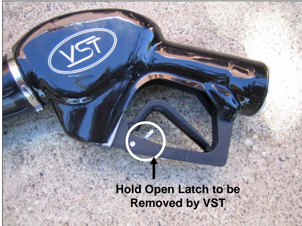
Figure 2: VST Balance Nozzle with Hold Open Latch Removed